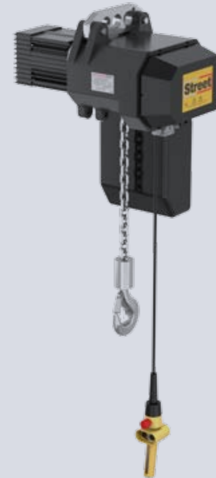
LX EYE SUSPENSION HOIST

Standard headroom and eye suspension models optimise side hook approaches but for those applications where upper hook position is critical in a restricted roof height the Street low headroom hoist with chain diverter trolley provides an unbeatable compact solution.