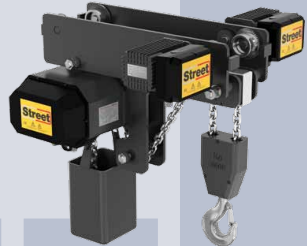
LX LOW HEADROOM HOIST WITH POWER TROLLEY